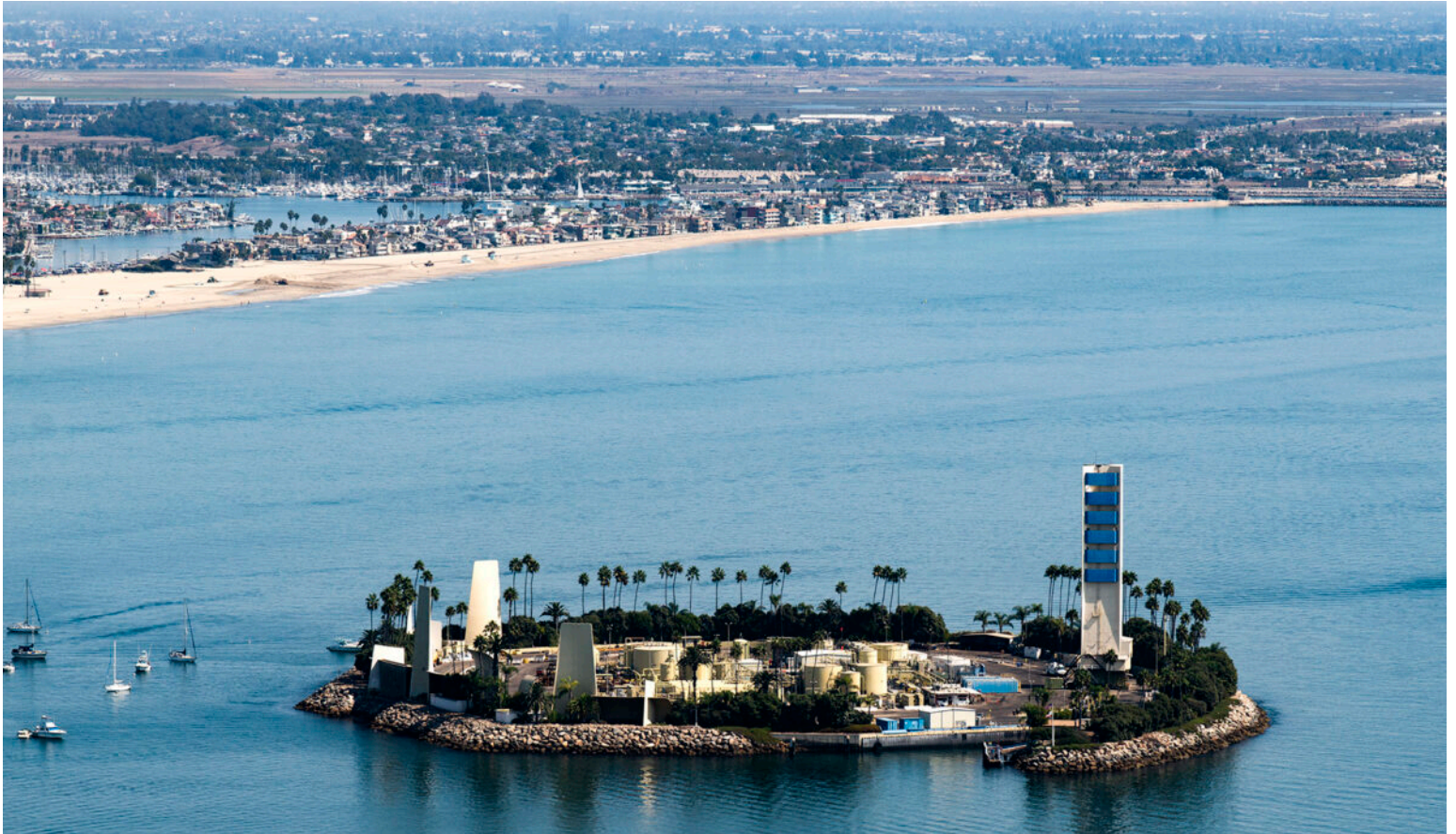
Oil island Grissom with the Long Beach Peninsula and Alamitos Bay in the background on Thursday, Oct. 1, 2020.

Losses could put at risk $1 billion in outstanding coastal projects , including a deteriorating Naples Island seawall , a long-delayed Belmont Aquatics Center and costly upgrades at the Convention Center.